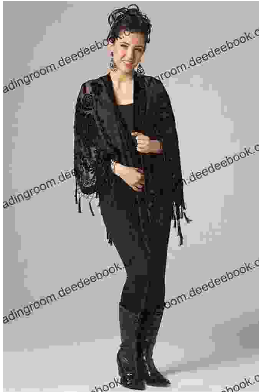
"Midnight Shimmer" Black Beaded Shawl