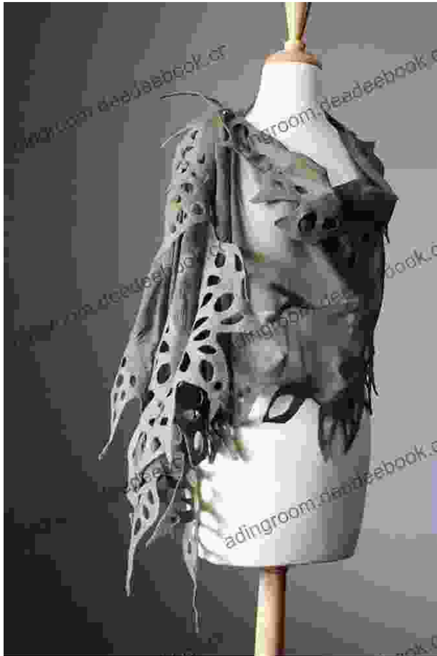
"Enchanted Forest" Openwork Beaded Shawl

Lose yourself in the enchanting beauty of the "Enchanted Forest" Openwork Beaded Shawl. Its openwork design, adorned with delicate beads, creates a mesmerizing effect that resembles a mystical woodland.