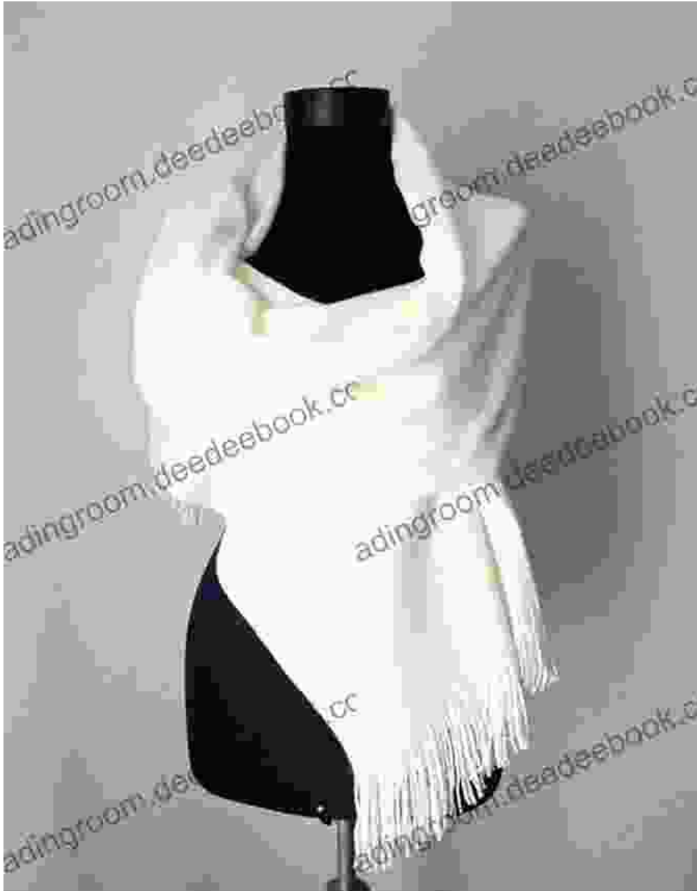
"Winter's Embrace" Warm and Cozy Beaded Shawl

Embrace the warmth and comfort of the "Winter's Embrace" Warm and Cozy Beaded Shawl. Knitted in soft, neutral tones, this shawl is a haven of coziness during the colder months. Its intricate beadwork adds a touch of understated elegance, making it a versatile accessory that can be dressed up or down.