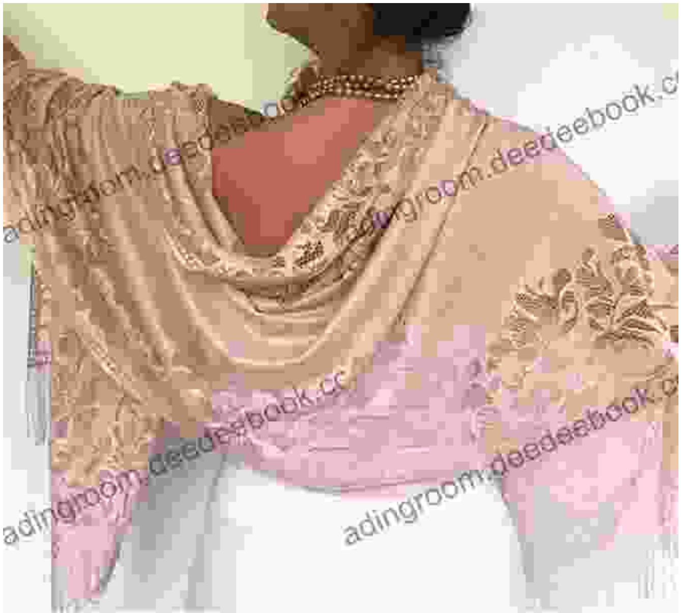
"Whispers of the Wind" Featherlight Beaded Rectangular Shawl