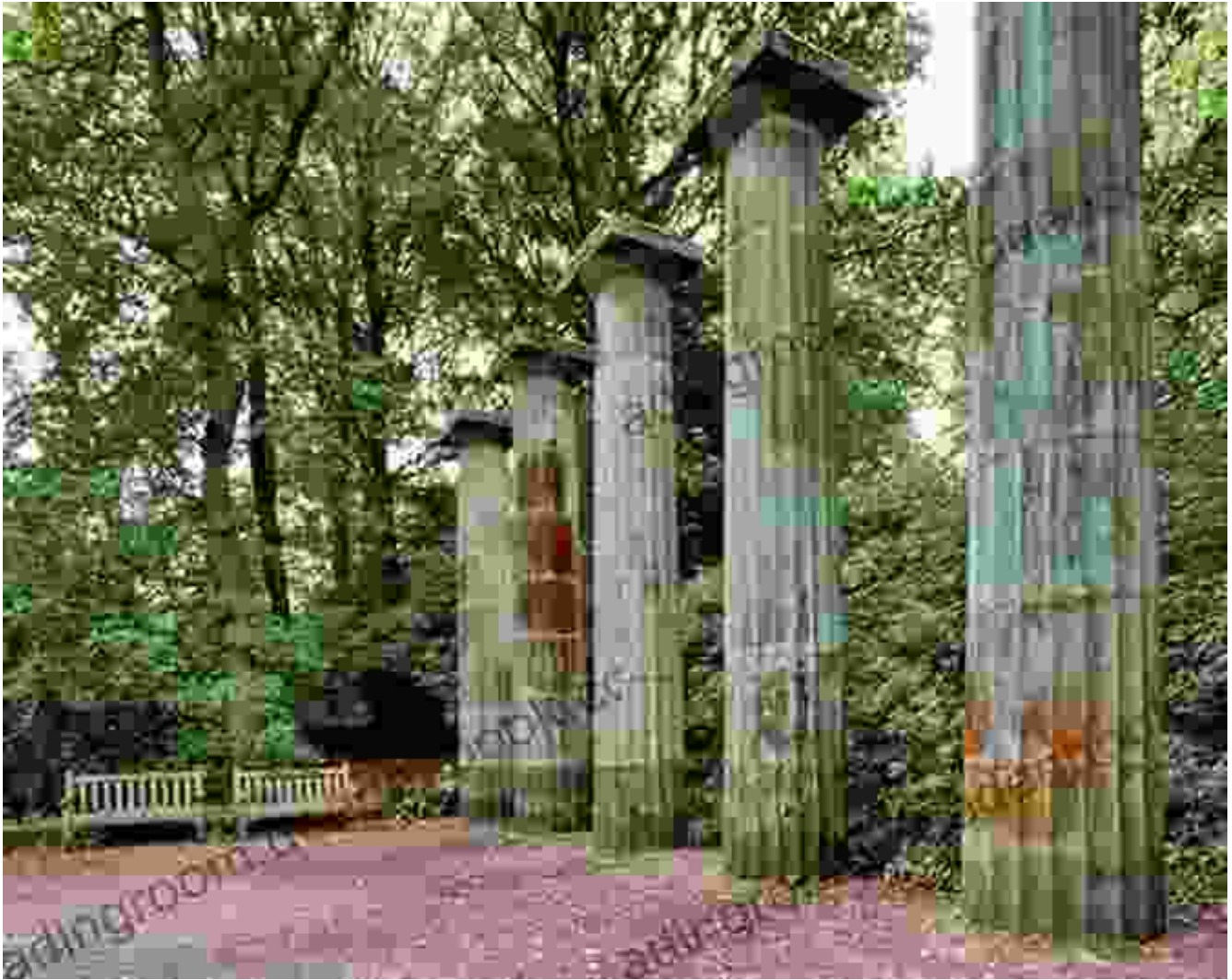
Exton Park Folly