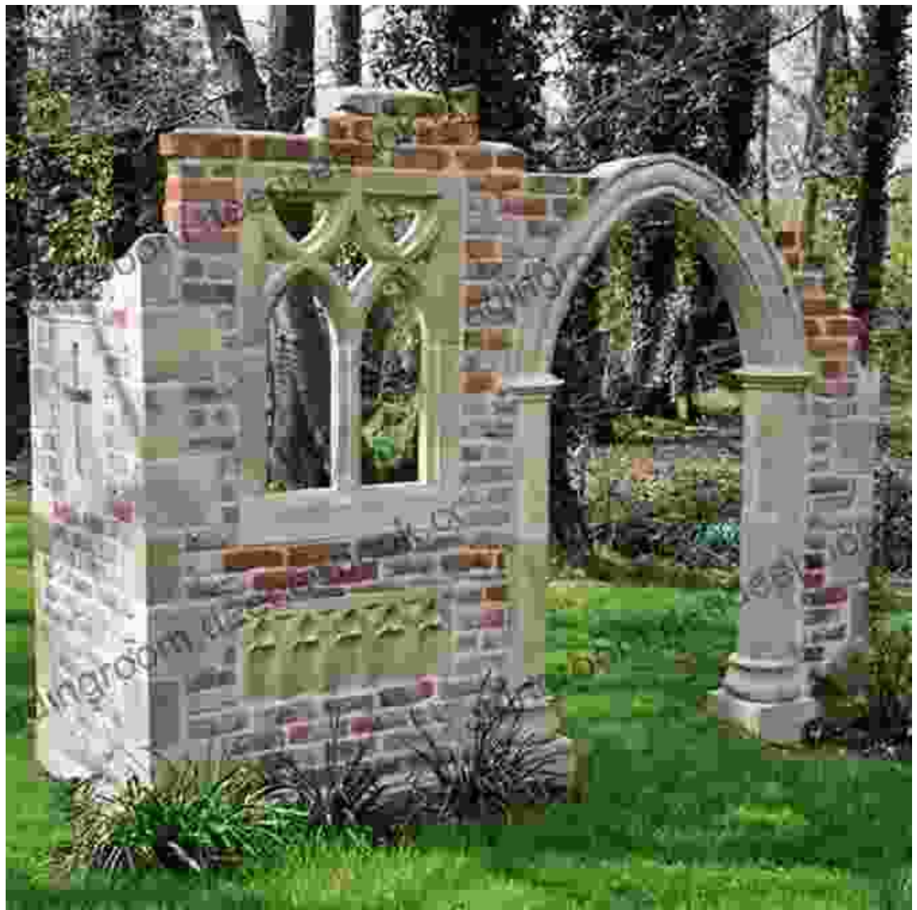
Launde Abbey Folly