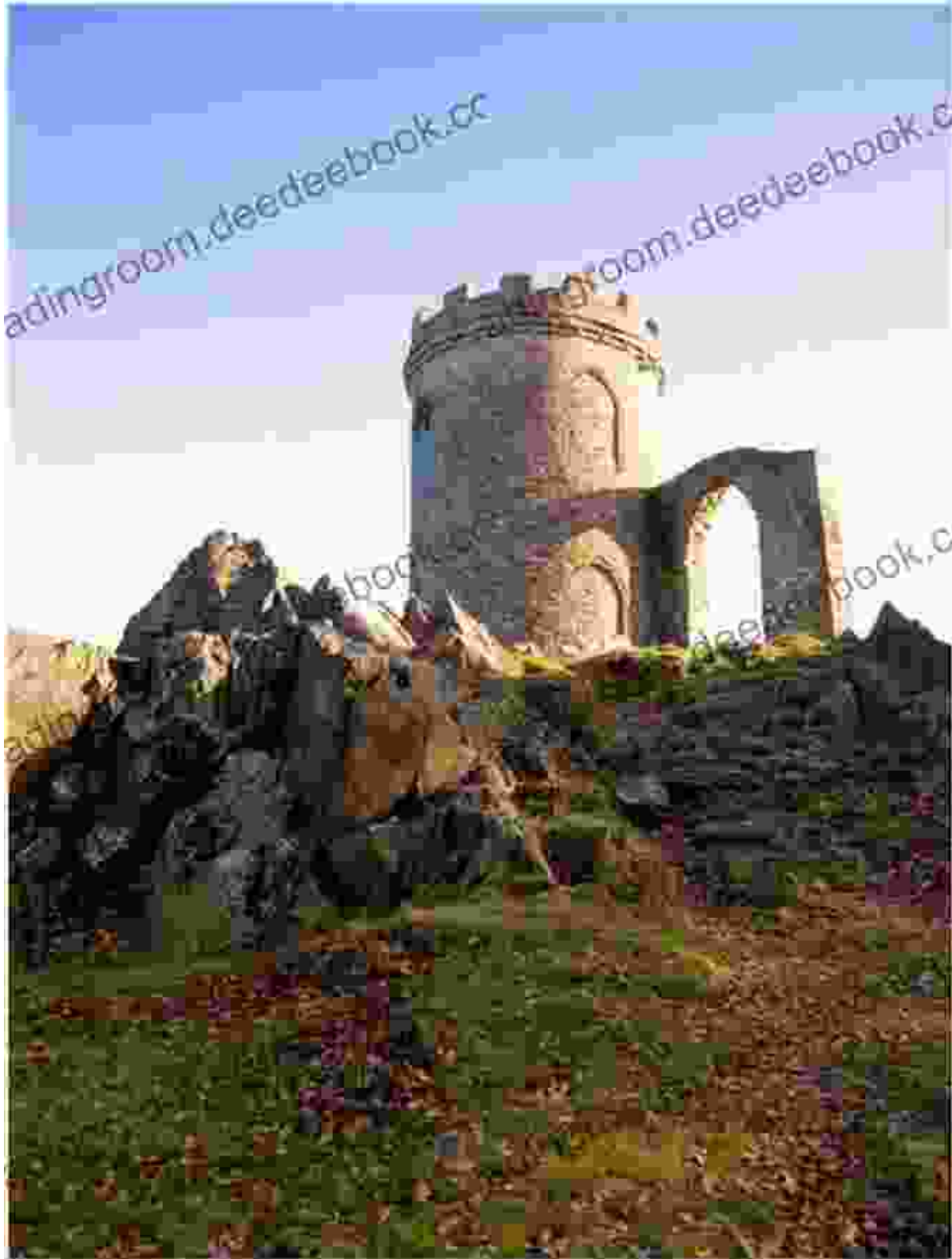
Bradgate Park Folly